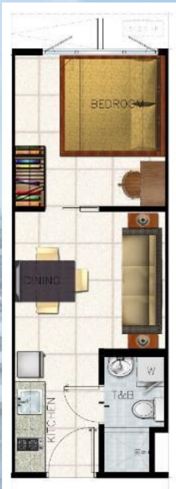
1 BEDROOM UNIT ±26.35 sqm