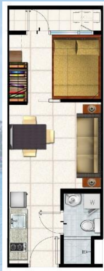
1 BEDROOM UNIT WITH BALCONY ±26.35 sqm