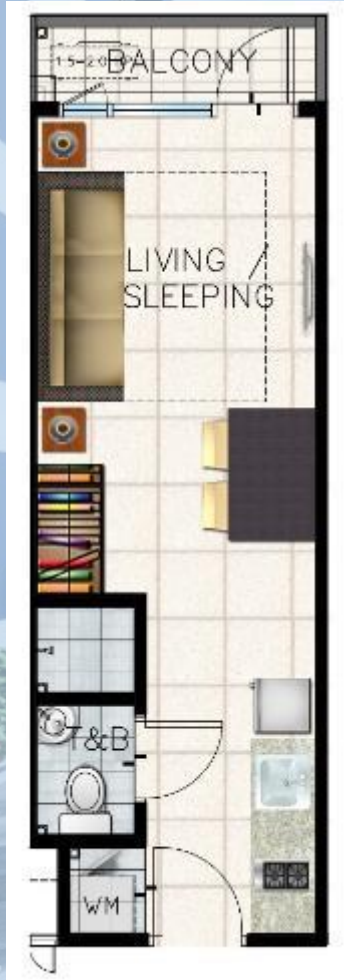
STUDIO UNIT WITH BALCONY ±22.95 sqm