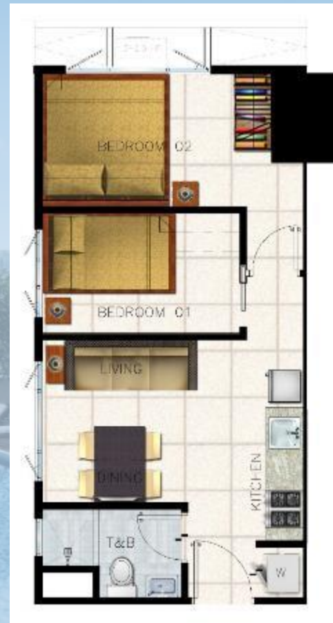
2 BEDROOM UNIT ±36.55 sqm