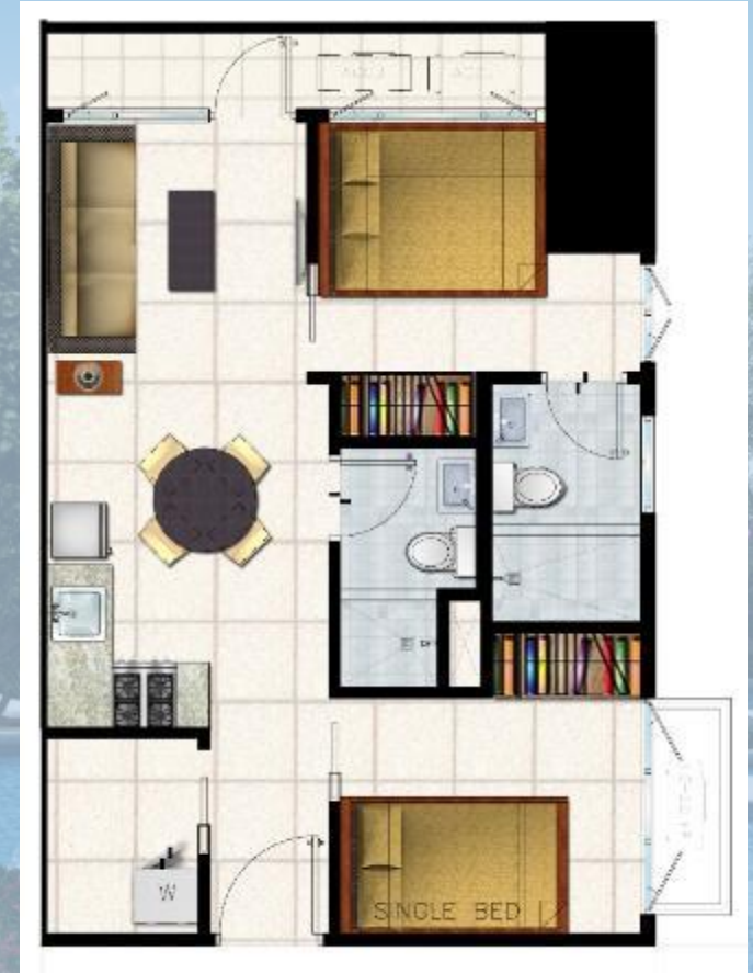
2 BEDROOM UNIT WITH BALCONY ±46.38 sqm