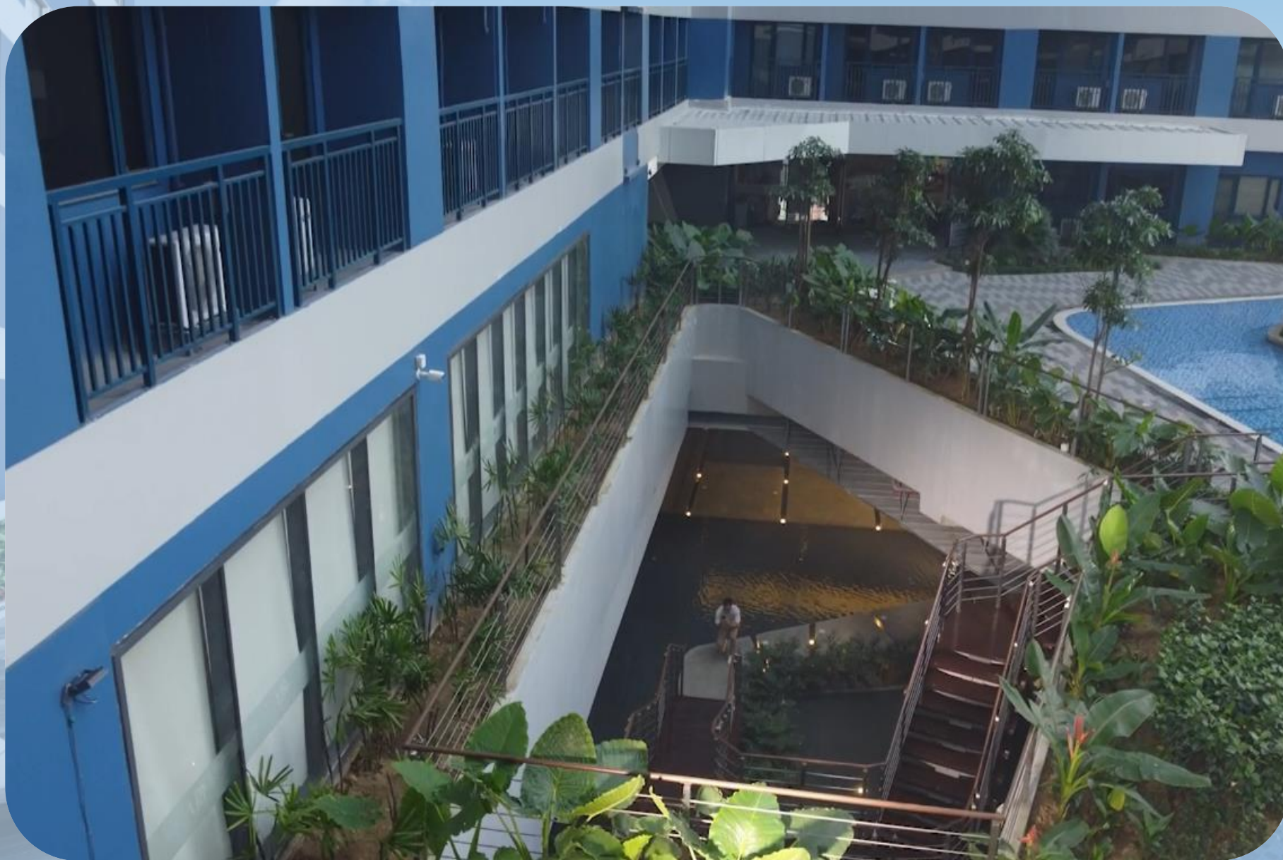
Staircase to 7 th Floor